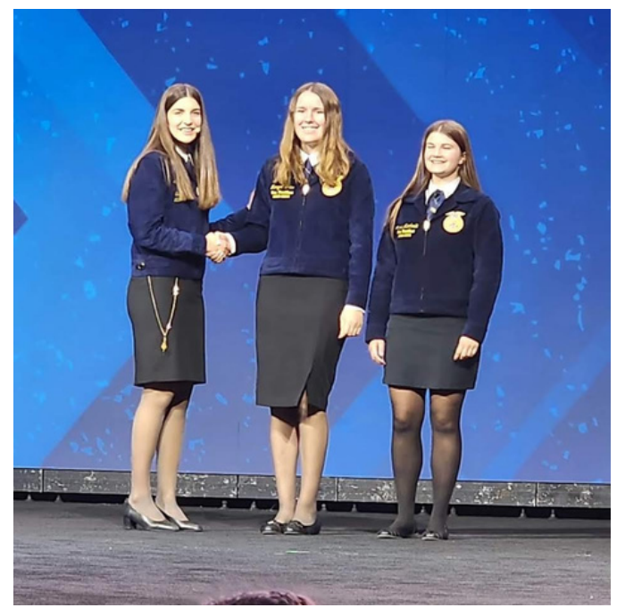
Denmark was recognized on stage as a Three Star Gold chapter this year! The highest ranking possible.